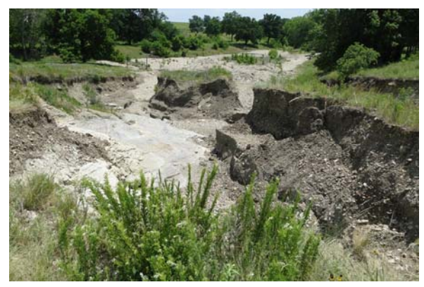
Damage from auxiliary spillway flow on watershed dams