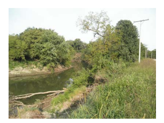
Streambank erosion threatening road and power lines