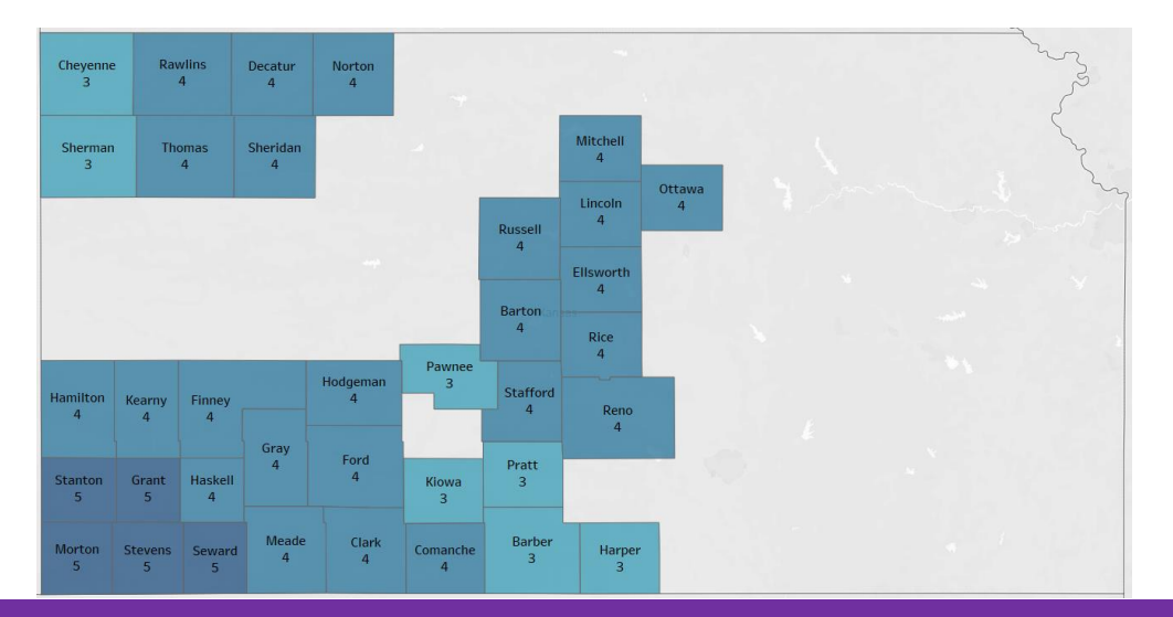
Figure 3. Kansas Counties Eligible for LFP Payments on Native Pasture -May 12th

Currently, there are 36 Kansas counties that qualify for LFP payments on <u>native pasture</u> (Figure 3). The number on the map refers to the current number of monthly payments the county is eligible for. Other counties in Kansas are eligible for payments on annual crab grass, annual rye grass, cool season improved pasture, warm season improved pasture, forage sorghum, and small grains planted for grazing. See the 2022 Program Year Livestock Forage Disaster Program <u>Maps</u> to see eligible counties for each forage type.